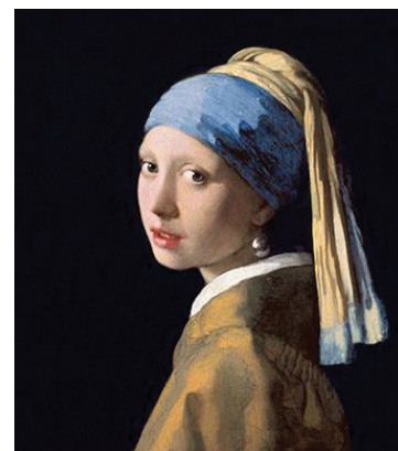
Dutch artists are responsible for many of the world's most famous paintings