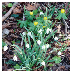
Snowdrops & Aconites