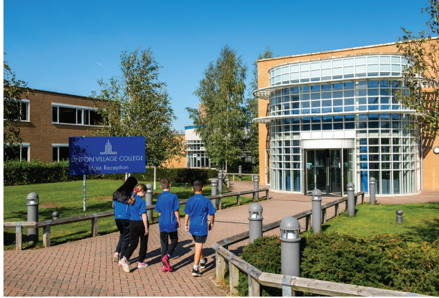
Despite new additions, many College buildings are tired and outdated

building programme. This application was initiated and developed by our Trust Central team, who will continue to support the school as plans progress. This is exciting news for Anglian Learning and Linton Village College, and will further empower learners to thrive and succeed as part of our strategy of enabling excellence for all."