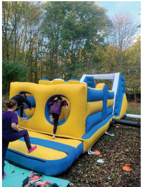
Guides tackling the bouncy obstacle course

IT'S been a fabulous year for all our units, culminating in a winter camp for 1 st Linton Guides, held outside in the woods at the Jarman Centre. They even had a bouncy obstacle course.