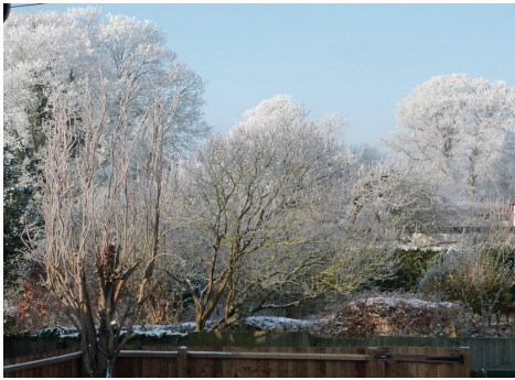
A Frosty Morning