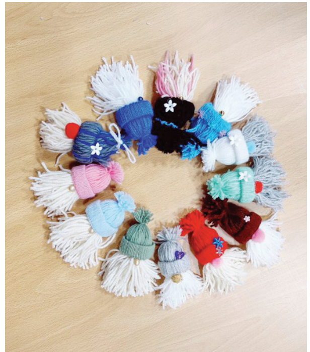
Christmas Gnomes keeping warm in their cosy hats