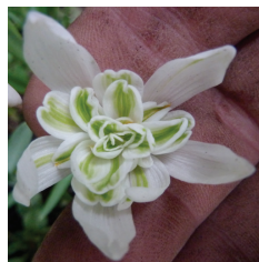
Double Headed Snowdrop