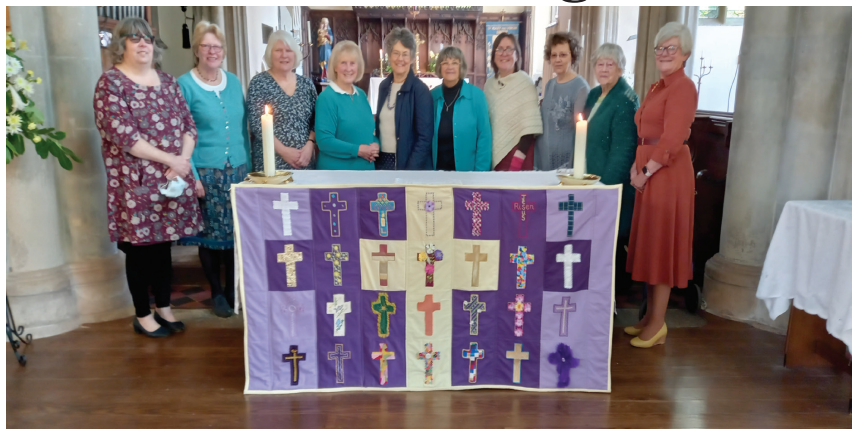
Just some of the volunteers who helped create the Easter altar frontal