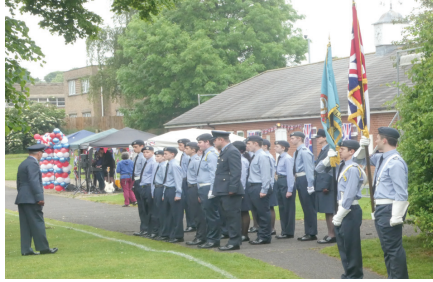
Linton 2523 Squadron Air Cadets

The event started with a service of celebration from St. Mary's and the Linton Free Church, followed by a parade by our Air Cadets 2523 Squadron.