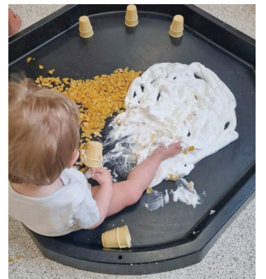
Having fun at Stay and Play