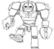
An artist's impression of how the robots will almost certainly not look

THE County Council, in conjunction with Starship Technologies, have launched a pilot food delivery service using robots in Cambourne. The 12,000 residents will benefit from having groceries delivered to them from the local Co-Op via a motorised autonomous vehicle. Initial tests have been positive, and if the trial is a success, the scheme will be rolled out to other villages, likely including Linton. Orders are made through the Starship food delivery app, which is available to download on iOS and Android devices. Groceries will then be delivered from the local Co-Op in as little as one hour. It is hoped that the scheme will cut down on short car journeys and alleviate traffic and parking issues. An average robot delivery uses as little energy as boiling a kettle to make a single cup of tea, and cutting edge cameras and sensors ensure the safety of the public.