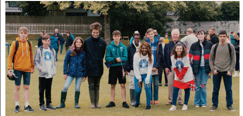
The St Mary's team

AFTER the brilliant sunshine during the week for the Jubilee celebrations, Sunday turned out to be cold, overcast and drizzly. However, it didn't dampen our enjoyment for a joint service with the Linton Free Church of thanksgiving for Her Majesty the Queen. Over 200 people gathered on the recreation ground for a 30-minute service of songs, prayers and reflection. Members of the churches' youth groups wrote and delivered their own prayers celebrating the Queen's many virtues of leadership and Christian example.