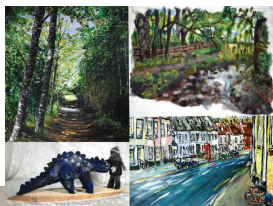
Linton News Team

will find paintings, ceramics, sculpture, glass art, textiles and much more and entry is free to all studios. Look out for our yellow flags! Sue's studio in Linton Road, Hadstock will be open the weekends of July 16 - 17 and July 23 - 24 from 10am to 5pm each day. The Cooper's studio will be open weekends beginning 9 th , 16 th and 23 rd July 9am- 5pm.