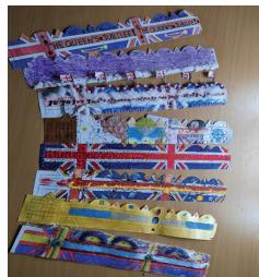
Linton Heights Crowns

Most of the village schools took part in a competition to decorate crowns and these were judged by the Linton Parish Council.