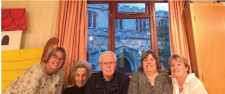
A 'Sharing is Caring' meet-up