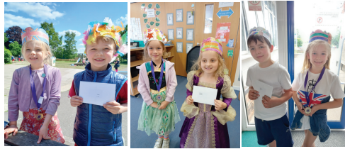
Linton Infants - Crown Competition Winners