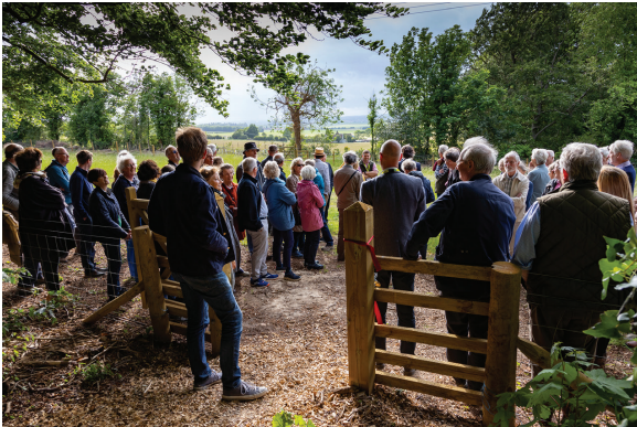
The opening ceremony

One of the new areas is called The Gallops and was used for training racehorses when Wandlebury was a stables during the 1800s. It is a lovely meadow with a