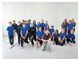
Students at Dance East in Norwich Year 9 students enjoyed a week's residential, either exploring cultural sights of London, engaging in on-water sports in Dorset or enjoying a week in the Peak District, having adventures with their peers. Meanwhile, our Year 10 students had the option of a week of activities at a PGL site in Lincolnshire or a work experience placement. I'm proud of the responsibility shown by LVC ambassadors in varied workplaces and to all of the students that engaged brilliantly with the week's enrichment programme. It's a testament to LVC staff commitment that we could organise so many trips.

LVC students enjoyed a full week of enrichment at the start of June. Following limited opportunities for trips and visits over the last couple of years, it was fabulous to see them benefiting from a varied programme of fun opportunities outside of the classroom. While Year 11s were busy with their GCSE exam series, all year groups were experiencing extra-curricular activities including a range of day trips for years 7 and 8. Highlights included the Nuclear Races, an extremely muddy assault course, bush craft workshops, a visit to Dance East in Norwich and hosting Year 6s from Linton Heights to showcase Year 7's performance skills.