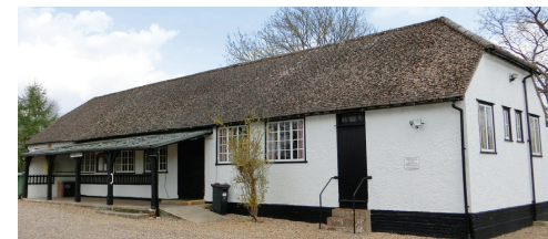
Above top, Radwinter village hall & bottom, Ugley