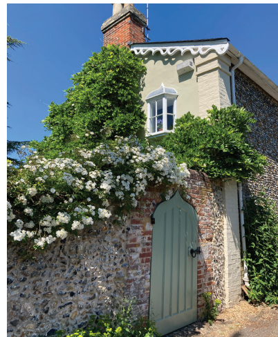
The Shrubbery in full sunshine