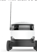
A less exciting but far more realistic photograph of the proposed robots

Linton News Team Drawing: Zdenek Sasek