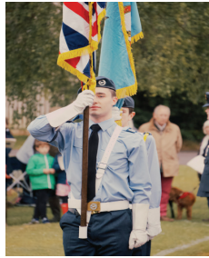
Above and left: 2523 performing at the Platinum Jubilee Picnic

2523 were delighted to be invited to parade for the village at the Platinum Jubilee party in the park event. With both the union flag and squadron standard on parade, the cadets turned out in their smartest light blue uniforms to mark this historic occasion.