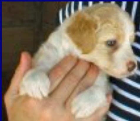
A bit of a handful

THE kindness of people in and around Linton is helping save and protect unwanted dogs on Cyprus - their used stamps are sold there to help pay for food and vets' bills for the 180 dogs, most of which will never know any other home.