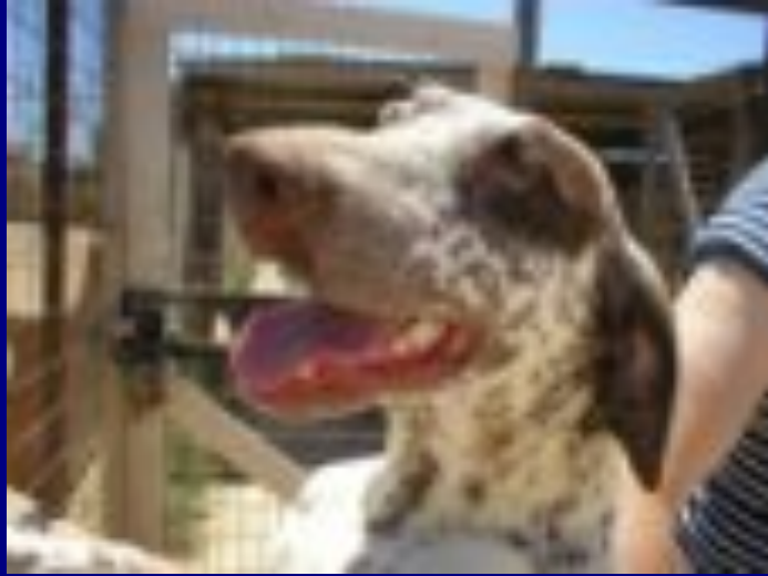
One of the lucky ones