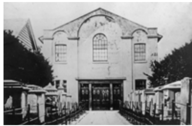
The Congregational chapel in Horn Lane

The richest non-conformist family in Linton, the Taylors, had their own private pew lined with silk bays and surrounded by silk curtains. This chapel was for the Congregationalists who numbered over 250 including worshippers from the surrounding villages. Galleries were built on both sides of the barn with a circular gallery in front of the pulpit.