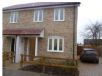
Example of the new social housing built on the site of unused garages in Chalklands last year

I have lived in Linton since I was a child, so know the village and the residents very well. I had lived in Back Road for 27