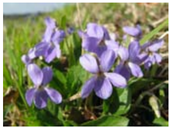
Viola hirta, The Hairy violet encourages the Dark Green Fritillary butterflies

THIS is a wonderful time to walk these two sites of special scientific interest now that the spring flowers are in bloom. Amongst the first to flower are the violets and, according to the leaflet prepared by the Friends of the Roman Road and Fleam Dyke (FRRFD or Friends), there are seven species ranging from purple to white with some pink ones too.