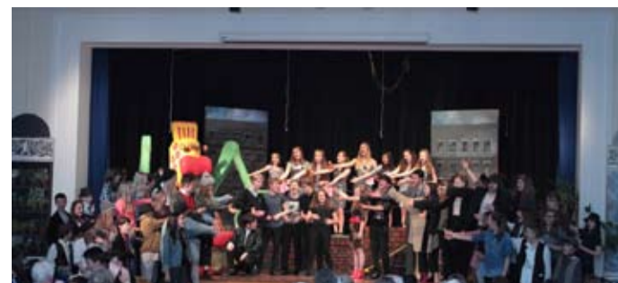
Little Shop's dress rehearsal