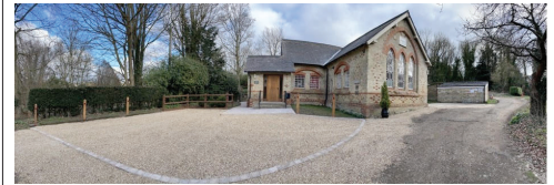
The Village Hall is the focal point of Hadstock

A NEWLY upgraded frontage to the hall has added seating which overlooks both the church and panoramic views. A paved pathway allows step free access to a rear garden with lawn, enlarged seating area, wooden tables and chairs, plus a covered pergola with power points and lighting. French windows lead directly into the main hall. The area is fenced and secure. There is a large parking area behind the hall.