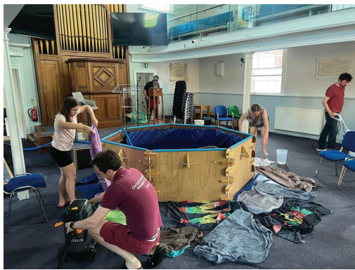
A small army descended on the church to help clean up