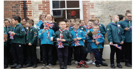
At the National Horseracing Museum

This might be one of the more regal events the Linton Scouts have attended, but the Beavers, Cubs and Scouts have a varied and fun-packed programme of activities. In order to provide this the group relies on its voluntary leaders and helpers. If you are interested in helping or have a child who would like to join, please contact: