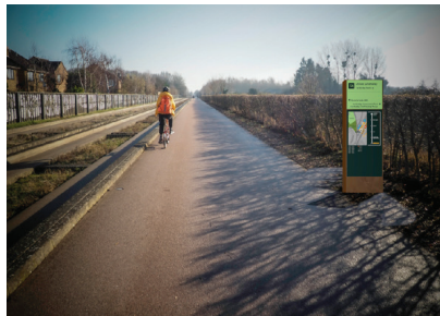
The greenway project aims to create a network of safe sustainable transport routes centred around Cambridge

THE Greenway works from Hildersham to Dale-Head Foods has been substantially completed, and the pathway and road are fully open. Greater Cambridge Partnership's original intention was to complete the planned carriageway surfacing by closing the A1307 between Haverhill and Fourwentways roundabout weekdays overnight, and diverting traffic to National Highways roads. However, they have now been advised that it is only possible to use this diversion at weekends.