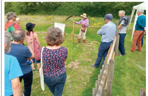
Visitors watch a scything demonstration