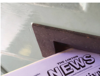
Going through letterboxes since 1987

The Linton News urgently requires a new editor; could you be the person to drive this much loved community publication forward?