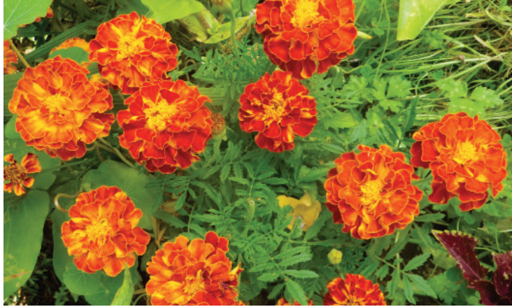
French Marigolds providing vivid colour in the borders