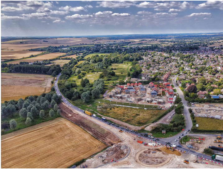
SLOWLY but surely: The Bartlow road roundabout begins to take shape. This drone photograph was taken by Les Redhead and shows the giant piece of infrastructure begin to emerge from the dirt. The roundabout is due to open in Spring 2024 and will be a vital step forward in safety for what is one of the most dangerous junctions in the area. LNT