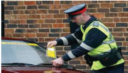
Civil Enforcement planned for Linton!

With notable concerns regarding parking in the High Street, additional signage to Coles Lane car park has been applied for, to encourage visitors to use the facilities which are often overlooked. It is only a short walk to the shops in either direction, and remains free to use. Parking bays will also be installed at the Dog & Duck to ensure best use of the available space, also ensuring access is kept clear for Meadow Lane.