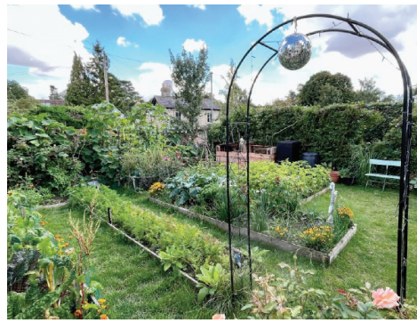
Garden at 20 Mill Lane, Linton.

THREE gardens in Linton will open for charity on Saturday 30 th September this year, from 1pm to 5pm, as part of the National Gardens Scheme (NGS). After successful group openings in May 2022 and June 2023, showing the late spring and early summer flowers, this will be the first time people can visit Linton gardens in the autumn. Tickets for all three gardens will cost £5 each for adults (children free) and can be bought on the day at any of the gardens.