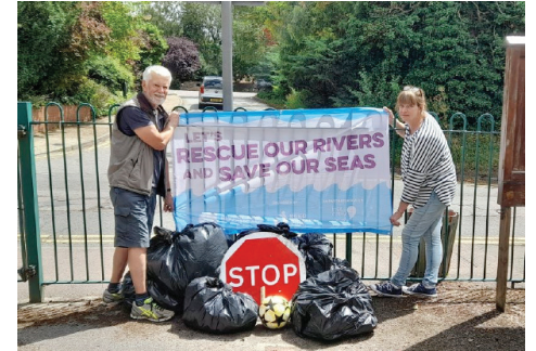
Litter Pick Volunteers 15 th July 2023