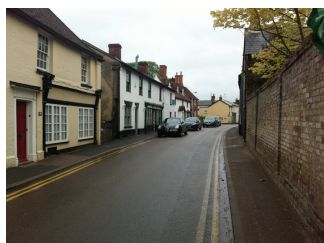
Half of people speeding on the high street live in Linton

Other roads monitored were Balsham Road, Horseheath Road, and Hadstock Road. In the case of Hadstock Road, the highest number of speeding offences came from those in what the police categorise as "immediate surrounds," namely neighbouring villages, together with Haverhill and Saffron Walden.