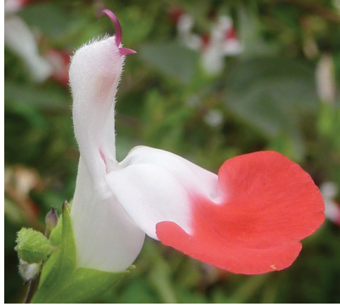
Salvia Hot Lips

In the garden, the rain returning during October along with the exceptionally mild weather through early November caused a late flush of flowering in some plants. On our patch, salvia Hot Lips looked beautiful in early November covered in white and red bicoloured flowers.