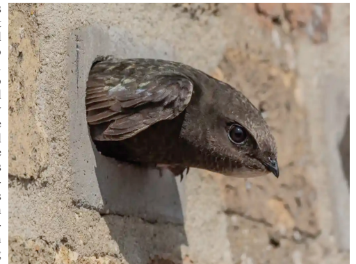
A resident exiting through a Swift Brick. Swifts can fly for ten months at a time, eating, sleeping and mating all whilst airborne. They remain one of the most mysterious birds in the animal kingdom but are under serious threat.

Linton News Team and Alan Sanders