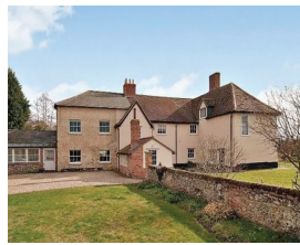
Little Linton House

But the major change is that it now covers Little Linton, including woodland and the remains of a mill and fishponds. The majority of buildings in Little Linton are individually Listed but this extension will help to maintain the rural character to the West of the main part of Linton.