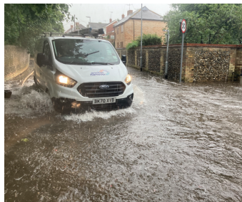
Flash floods hit the village in July 2021 causing major damage to homes

Amid increased extreme weather events brought on by the climate emergency, the agency launched an awareness campaign last month to encourage those who live in areas at risk of flooding