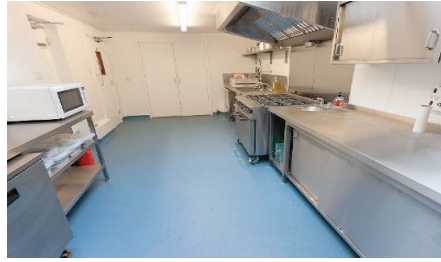
The new kitchen at Linton Village Hall

THE team of Trustees have exciting plans for the Village Hall. We have completed the first step by refurbishing the kitchen and would like to share our aspirations with all interested parties.