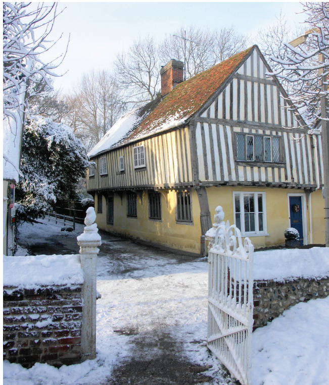
The Guildhall on a freezing winter's day