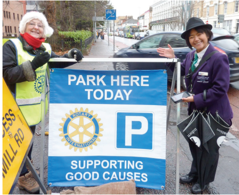
Look out for these signs

ONCE again this December, Christmas shoppers visiting Cambridge will be able to enjoy cheap all-day car parking while supporting local good causes. The funds raised will be used by the Rotary Club of Cambridge South to support charities and good causes.