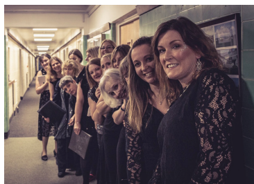
The Belles Choir

ON 19 th December at 7pm there will be a festive concert in St Mary's church in aid of our local Arthur Rank Hospice Charity. Christmas favourites old and new will be performed by professional duo Soprriola (voice and viola) and by the Belles choir. Audience carols and mince pies will add to the occasion! Entry is free with a retiring collection. All proceeds will support the important work of the Arthur Rank Hospice Charity. Everyone is welcome and we look forward to seeing you there.