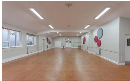
View of the main hall

It could be that you would like to play Bridge, try out book binding or simply listen to the talks provided by the Historical Society. These are just a taste of what's on at the village hall each month.