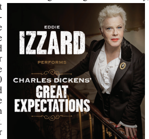
Izzard's Great Expectations has been met with universal critical acclaim

something that had never been done before. George said "I've had a great career but I chose the country life 20 years ago and I'm all done and dusted with showbiz now. I'll still answer the call when something artistically worthwhile comes up, but other than that I'm here to stay." Izzard's Great Expectations sees the comedian and actor perform all 19 main characters from Dickens' novel in a darkly gripping solo performance. It runs at the Garrick Theatre until the 1 st of July.