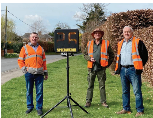
Speedwatch team members. Speedwatch is a community driven and effective tool. Most people just need a gentle reminder.