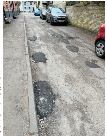
The road surface on Horn Lane: Charmingly rustic at very best