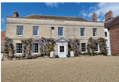
Linton House in the sunshine, come and see the garden on the 18 th

The participating gardens are as follows: 3 Mill Lane (Millicent House); 14 High Street; 16 High Street (Queen's House); 64 High Street (Linton House); 94 High Street.