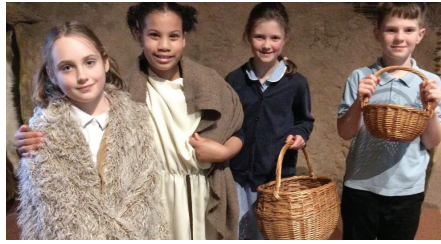
Pupils having fun