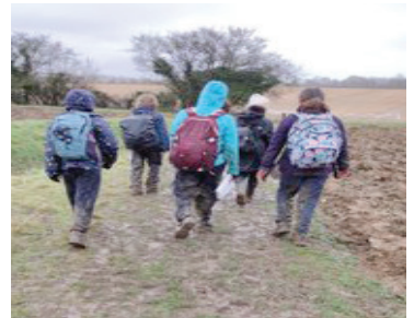
Rangers and Guides hike

@Lintondistrict or Like us on Facebook www.Girlguiding.org.uk/interested lintondistrict@gmail.com