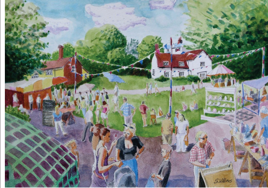
Artist Sonia Villiers' impression of the village green

THIS summer, after a two year break, the Hadstock Fete is back on Saturday 18 th June 2022. The Fete attracts over 1,000 people and raises much needed funds for the Village Hall and St Botolph's Church, both beautiful assets in the village of Hadstock.