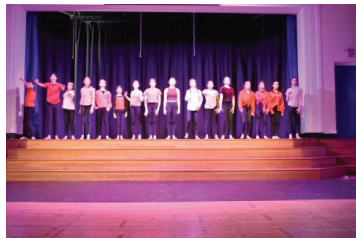
Students performing in the dance show