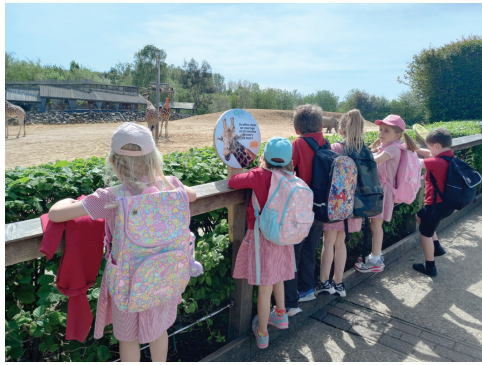
Meeting the giraffes at Colchester Zoo

Year 2 had a great school trip to Colchester Zoo! These trips are so vital to the experiences the children have. From making their own packed lunch, to the coach journey, then the Zoo itself, the children had such a great time. Thank you to our PTFA who support these trips by helping to fund the coaches, keeping the cost to parents at a minimum. On 18 th May we welcomed parents into school who have children joining us in September, one of our first in-person events for a couple of years now. It was nice to meet new parents and also, to see some familiar faces. We are looking forward to welcoming the children into school in September. Our PTFA are currently organising our popular Summer Fair, which is on Friday