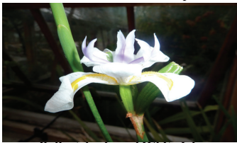
Delicately shaped White Iris

Back in our own garden we have found that irises distract the eye away from all the withering spring bulb foliage and nicely fill the gaps until the summer border plants become established. Now all risk of frost has passed, tender plants can be planted out after hardening them off. "Hardening off" means gradually introducing your indoor raised plants to the outdoor conditions of harsh direct sunlight and blustery winds and rain. Simply pop them outside during the day for a week or so and they should then grow well when planted out.