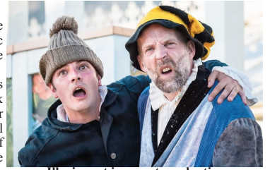
Illyria cast in a past production

Award-winning Illyria Outdoor Theatre is celebrating its 30 th anniversary, and to mark this milestone they are re-staging popular shows from their back catalogue. This will include an outdoor version of The Pirates of Penzance. Fulbourn Arts are privileged to be part of Illyria's celebration. Performed by a six-strong cast with specially-orchestrated