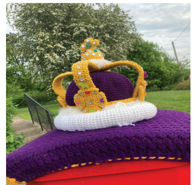
Above left: The new crown complete with guards. Right: the stolen original

LINTON'S Karen Sanderson surely wins the award for dedication to the cause after having crocheted TWO incredible crowns to celebrate the Queen's platinum jubilee. Sadly, the first one was stolen from its location on top of the Chalklands post box, and a £50 reward for its safe return remains unclaimed.