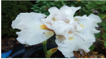
Ruffled White Iris

AT the Gardening Club's May meeting, Wendy Overy from 'Fenland Flowers and Foliage' gave a delightful talk on 'Growing for Cut Flowers'. Wendy grows a selection of traditional cottage garden flowers and bulbs on her plot near the Lakenheath fens as sustainably as possible. She uses the no-dig method where the plants are grown in thick layers of mulch in either a polytunnel or outside and she waters them with stored rainwater. As well as showing us how she grows her plants she also gave the audience numerous tips on when and how to cut and prepare the flowers so that they look their best for the maximum time in vases. This was the last talk before the club's summer break. Our meetings will resume in September.