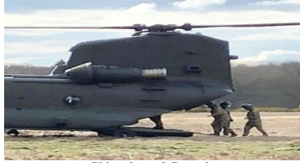
Chinooks and Crannies

WE have now had a full report from our cadets from camp. They had a fantastic time and a few of their activities included fieldcraft, abseiling, arms drill and flying in an RAF Chinook. Some amazing experiences, and our cadets with summer camp places eagerly await their turn.