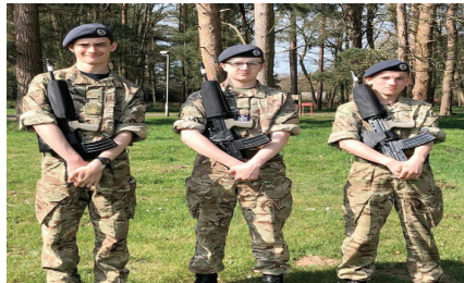
Locked and loaded on the target range

museum, with demonstrations in drone racing, virtual reality drone flying and most impressive of all, model rocketry. The cadets were even able to be on launch control and launch the rockets themselves. "It was great to be able to have physical demonstrations of rocketry", said Sgt Norris. "We have theoretical space training, but seeing the rockets and launching them in person really makes the syllabus come to life.