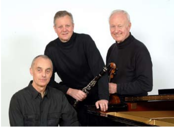
The Reinecke Ensemble who will be playing at the next music society concert.