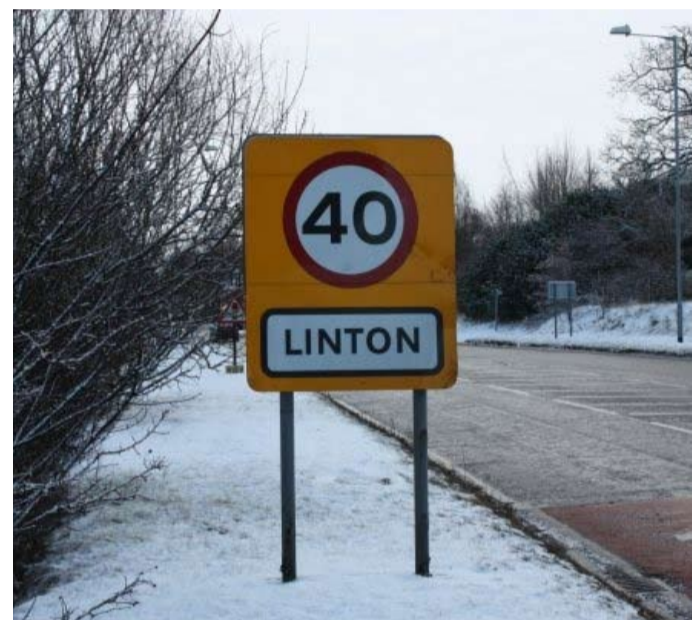
Unlike some of its neighbouring villages and towns Linton is not ‘twinning’

We were too late to submit an online application to set up a town twinning project ‘focused on citizenship or thematic networking’ in 2009 as applications to the Education, Audiovisual and Culture Executive Agency (EACEA) of the European Commission had to be in by the end of September - nothing to stop us going for it next year!