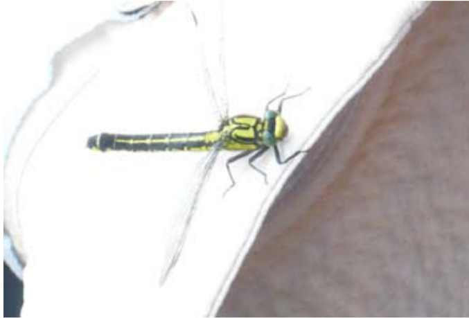
One of over 23 species of damselflies and dragonflies found in the fen.

pests. All are welcome to join us in the village hall at 7.30pm to find out alternative methods for ridding the garden of those pesky bugs.