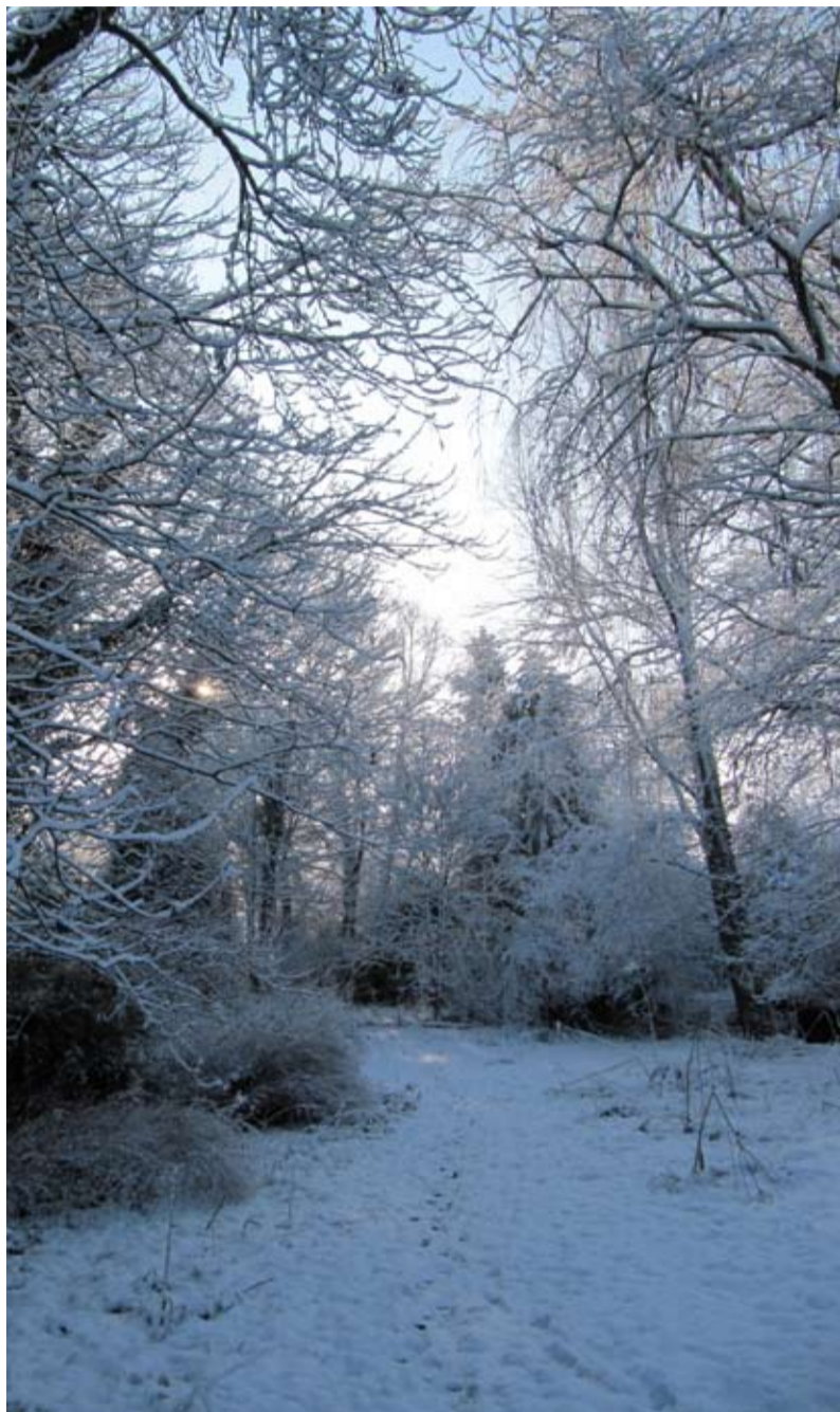
A few footsteps in a picture postcard scene