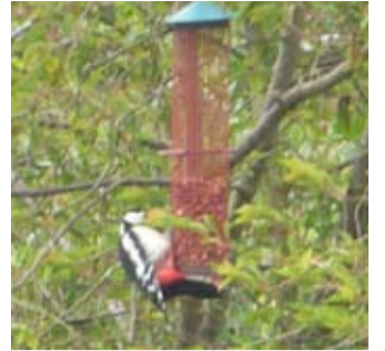
A great spotted woodpecker, on a nut feeder in my garden.

Core the apple (but don't throw the core away).