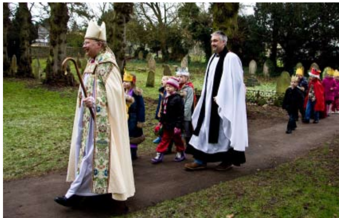
The parade between the school and the church, led by the Bishop of Huntingdon

Children arrived at school dressed as kings and, as always, the families of Linton did us proud with their efforts. All those invited (Great Abington and Burrough Green primary schools and Linton Heights junior school, the Bishop of Huntingdon and representatives of the Diocese education department) wanted to continue despite the event being without camels.