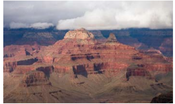
A view of the breathtaking Grand Canyon (above) and a 1950s Ford Edsel at Seligman on route 66, (right).

The Grand Canyon is a sight not to miss, although it can be difficult to capture on film as it is just so huge – the climate can also be very changeable as you are up at 7,000ft, so every day you can produce different-looking images. The whole of the watching audience was enthralled by the Wild West, where the roads are so wide that a wagon with eight horses could do a U-turn, and