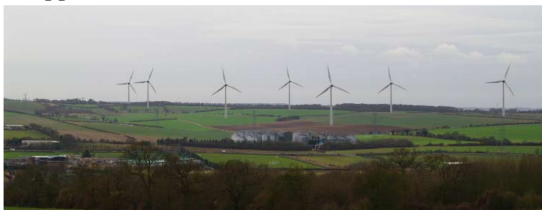
View from Rivey Hill showing proposed wind turbines

Anyone can attend the inquiry at any time, and come and go as