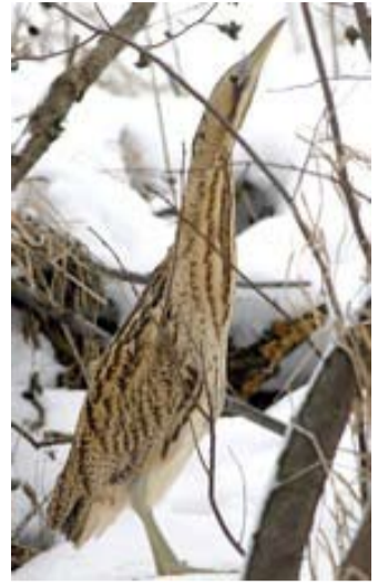
The rarely seen bittern becomes more visible in the snow