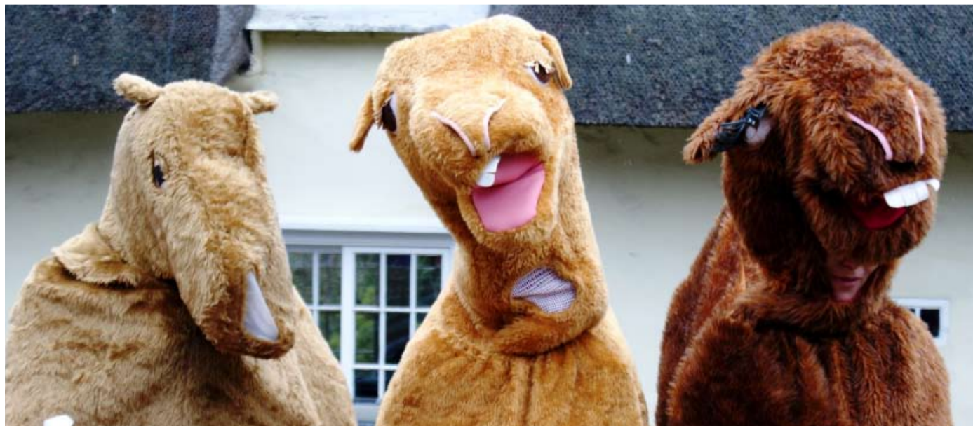
The three camels who braved the snow for the Epiphany