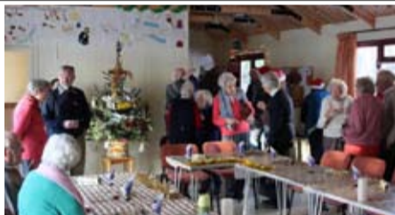
The party in progress