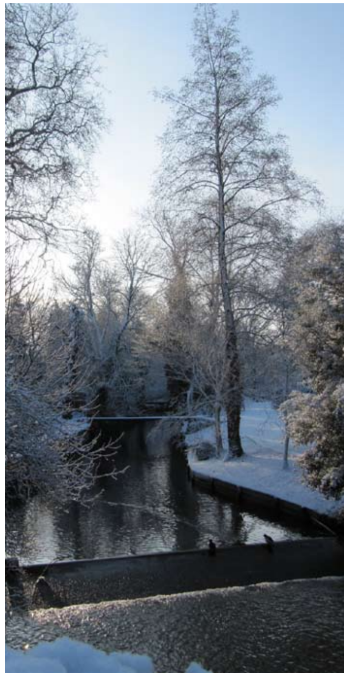
Reflections of a winter wonderland

FOR a while, the snow was the stuff of fairy tales and childhood dreams. It lasted for as long as we left the car in the garage ... then there was a swift return to reality and the nightmare of potholes. If you see a pothole please report it to 0345 0455212. If you do not report it, the powers that be do not know it is there!