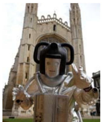
A cyberman taking part in last year's festival