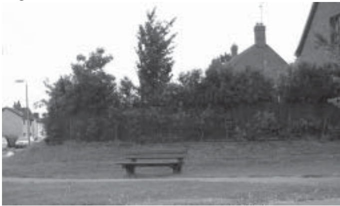
The Bench in Balsham Road see previous page

Minutes of the meeting of LINTON PARISH COUNCIL held at the Cathodeon Centre on Thursday 1 st June 2006