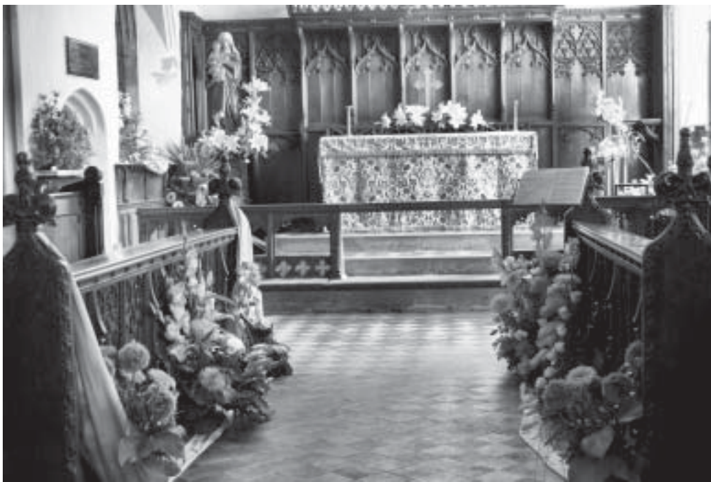
The choir stalls reveal the range of the arrangers' skills

OUR apologies to the Cambridge Evening News for omitting their credit on last month's teddy picture.