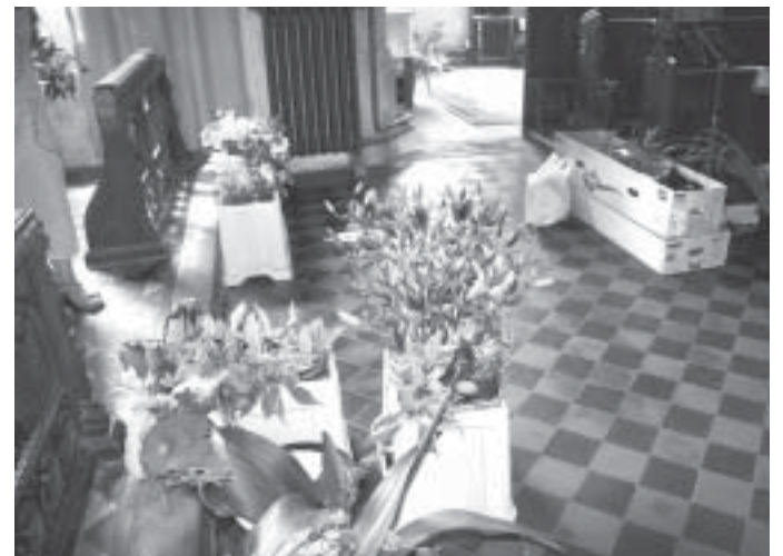
The flowers wait for the arrangers to start work