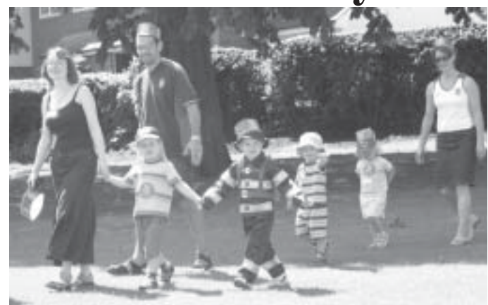
The big toddle: children trek round the recreation ground