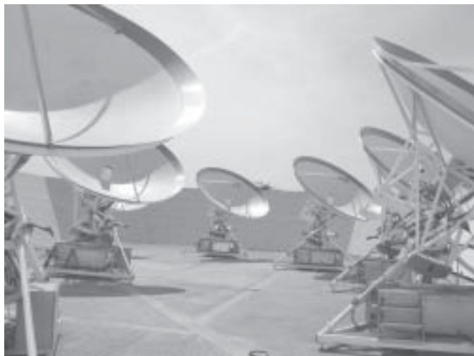
The Mullard dishes: tracking the history of the universe

At the moment, much of the current research is directed towards imaging the cosmic microwave background radiation. The data obtained can be used to explore the evolution of the universe and to find out the mass of the observable uni-