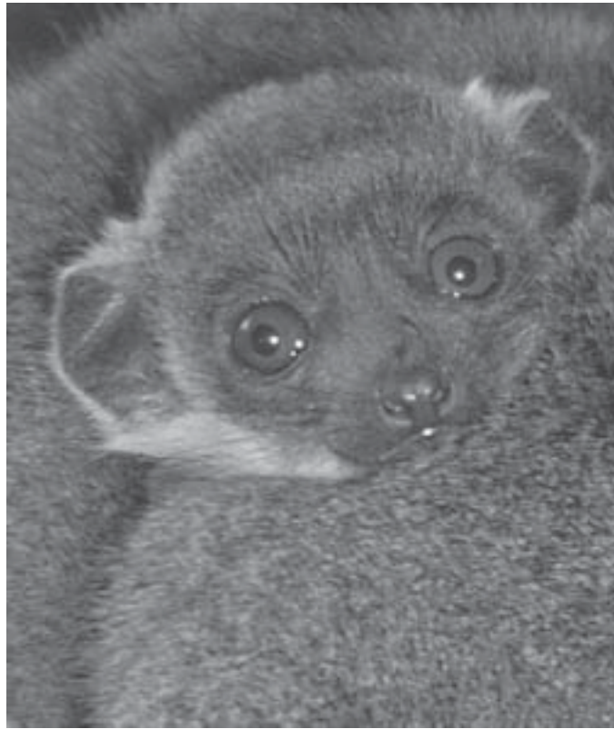
Here looking at you, kid: a baby mongoose lemur is one of the many new arrivals at Linton zoo

Volunteers are needed to help man our conservation stand during the summer, so if you are interested in helping to promote the importance of caring for the environment and wildlife conservation, and you have a few hours to spare between 10am-5pm any day of