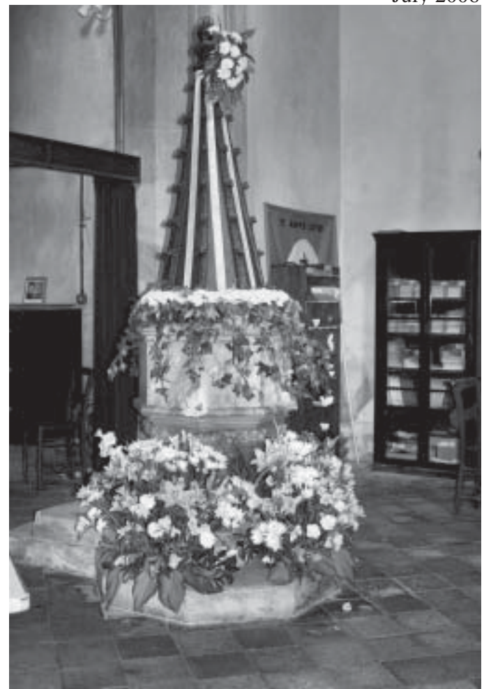
The font is garlanded with colour and foliage