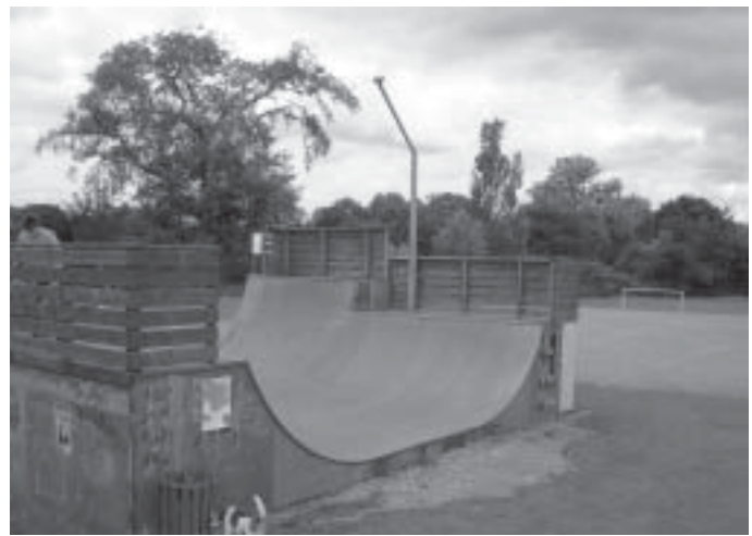
The Skate ramp on the Recreation Ground

No action will be taken until the third quotation is received Item 51 BAA Stansted re