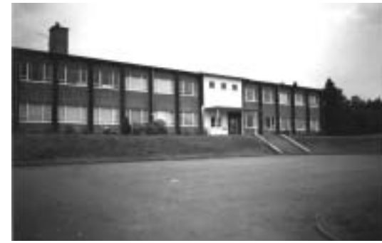
Cathodeon Crystals' building soon after it closed.