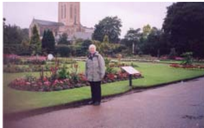
Yours truly in the abbey gardens with the abbey in the background, which look good even in the rain.

There was an art exhibition in the cloisters and refectory; three of us paint so this was a bonus. In the cathedral there was also a display of children's paintings. Some of these young artists were