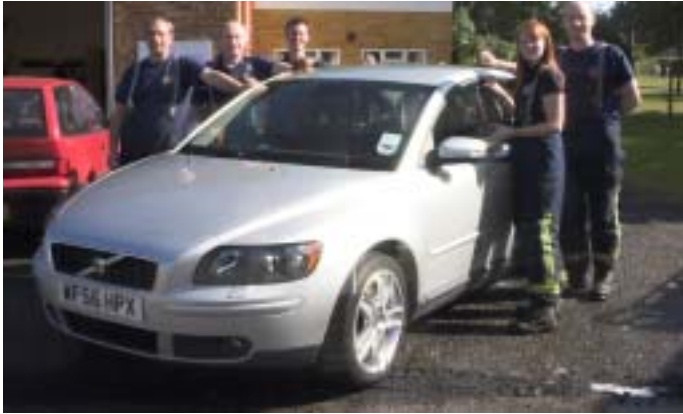
Members of Linton fire service wash cars for charity