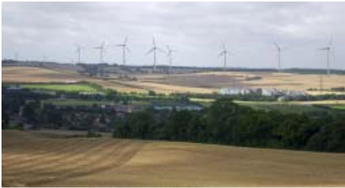
Scene from the future? A simulation of how Linton would look with the wind turbines

Although the noise level may be low directly underneath a turbine, from further away there can be a much greater effect. Sue Harrison, an A&E consultant, spoke of some research which showed the adverse effects of low frequency sound causing sleep deprivation, headaches, thickening of the blood vessels and other body changes.