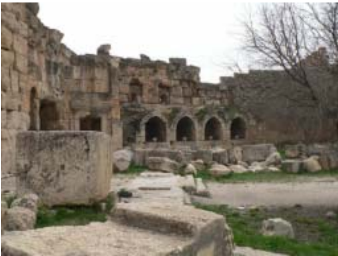
Temple of The Sun, Baalbek