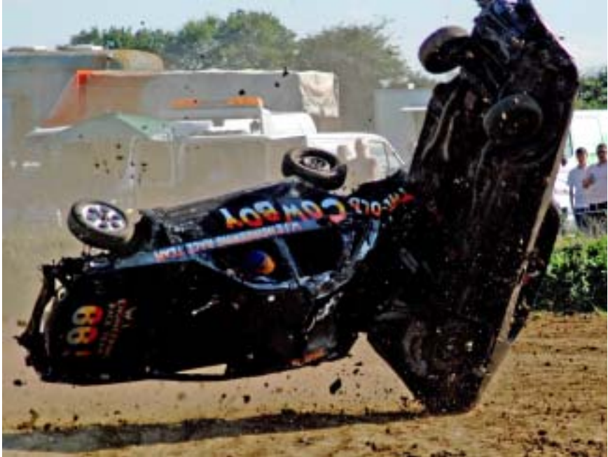
Picture power: these photos by Anne Guillmet (left) and Ron Pitkin (below) are two examples of the photos that will be on display at the Camera club exhibition

LINTON Camera Club will be opening the doors to its annual exhibition at the village hall on Saturday 13 th October with a free draw in which three winners will be able choose a photograph each from the exhibition, and receive it as a framed A4 print. There will be more than 200 photographs on display including a special series entitled ‘Linton Then And Now’ as well as a ‘Fun Corner’ where anyone can dress up and take photos, and Richard Smith’s digital advice stand. The exhibition will be an eclectic show spanning the wide interests of club members including portraits, action shots, landscapes, humour, wildlife, local scenes and faraway places. Upstairs you will find non-stop image shows by club members on the subjects of Travels in India, Las Vegas 2007, The Moment of Change in Papua, New Guinea, Winter at Niagara Falls and A Navajo Journey. Event co-ordinator Ron Pitkin said: “It will be an excellent show, full of interest and everyone will be most welcome.” The exhibition is open from 11.30am-4pm and entry is free. There will be refreshments and a raffle for the Alzheimer’s research trust. Recent club outings saw banger racing manager and club member Dave Stone