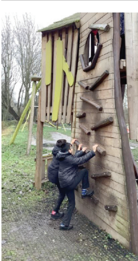
Pupils having fun and learning new skills