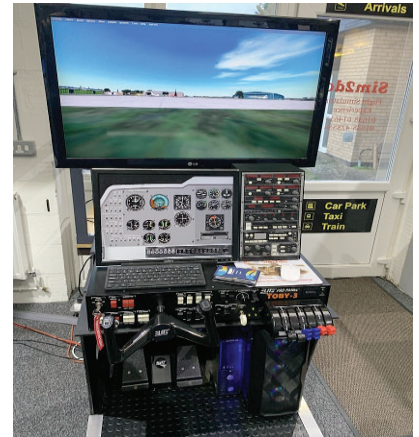
The new flight simulator

The squadron civilian committee is responsible for all our fundraising, and has now reached its long-term funding objective, to purchase the squadron a top-of-the-range flight simulator. As well as years of fundraising, the equipment supplier Sim2Do have very generously sponsored some items on the simulator.