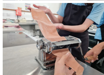
Mouth watering dishes being produced