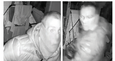
Police are appealing for information on the two masked intruders

Anyone with information on who these men are should contact police online quoting reference 35/5793/22. Anyone without internet access should call 101.