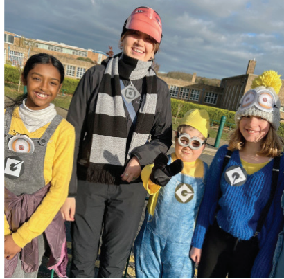
Minions on the sponsored walk

The autumn term has seen a fantastic array of arts events and activities. Platform 23 exhibition at Michaelhouse Café in Cambridge showcased wonderful artwork from our students alongside pieces from all Trust secondary schools. We hosted a Year 2 singing festival involving our feeder primary schools, which also included a performance from our choir, Linton Voices. Students taking Dance as an option also took part in a trip to Dance East to develop their theatre technical skills and work with professional dance companies in some intensive workshops. Lots of students across all year groups were involved in our Christmas Arts Showcase.