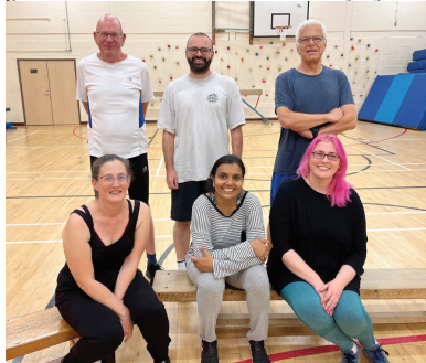
The 12 week programme has shown great results

A TWELVE week programme run by Anglian Leisure Sawston and Anglian Leisure Linton is delivering positive results following its first cohort of participants. The Exercise4Fun scheme, which is funded by South Cambridgeshire District Council, gives participants with a Body Mass Index (BMI) of 25 or above and who are inactive, a temporary pass to local sport centres helping them to kickstart their fitness and lifestyle journey.