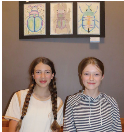
Students with their artwork