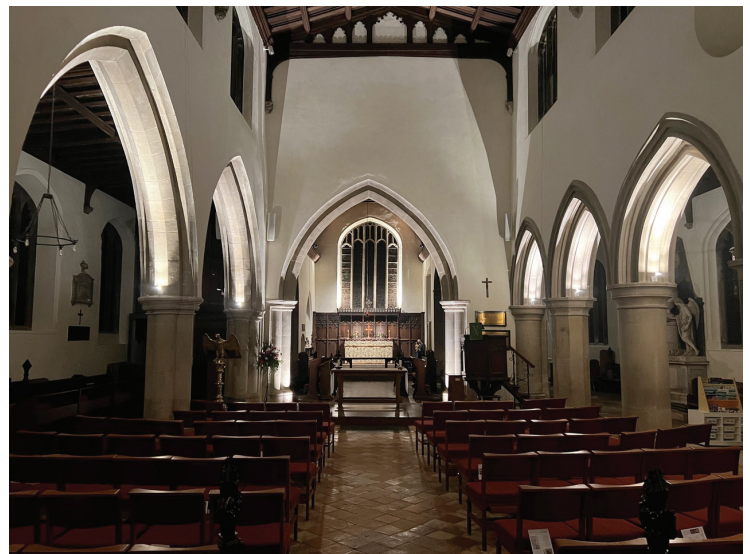
A photo of St. Mary's showing one of the many atmospheric lighting effects made possible by the new lighting scheme installed earlier this year which was funded by the Friends of St. Mary's. The Friends would welcome new members or donations. For more information please visit our website – www.friendsofstmarylinton.org.uk