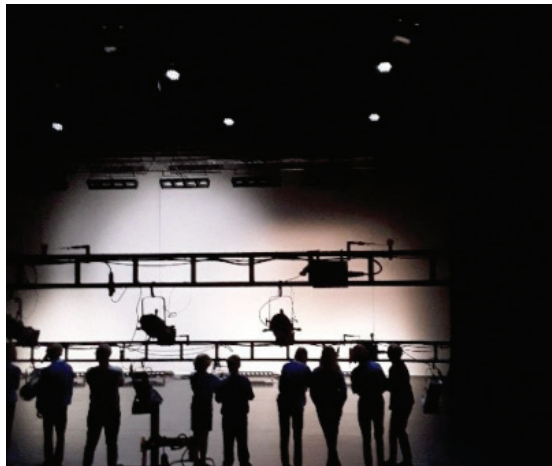
Developing theatre and performance skills