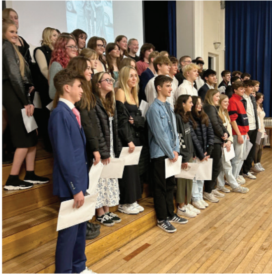
Class of 2023 return for their Presentation Evening

You may have spotted LVC students walking through the village and local countryside during our annual sponsored walk the following day. It was great to have the whole school involved on the 12-kilometre route fundraising for the Friends of LVC. With the fancy dress theme of 'At the Movies', students and staff made an amazing effort and made the walk that bit more colourful. Friends volunteers did a fantastic job of marshalling the route. We are very grateful for the support of this amazing group of parents/carers and community members to enhance and enrich LVC students' educational experiences.