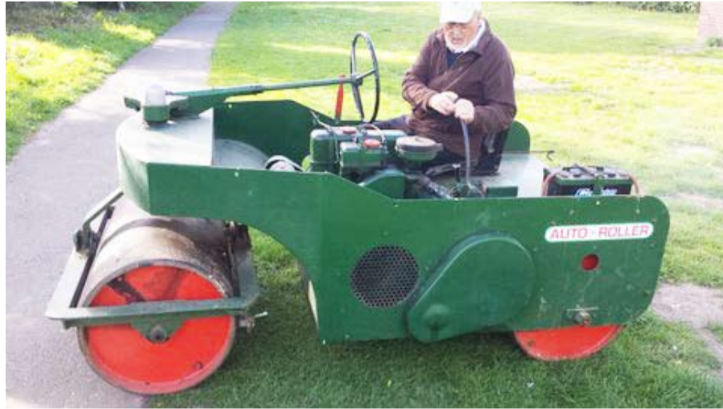
Labour of love: JR preparing for work on the cricket pitch