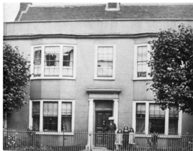
Queen's House or Barnet House around 1915