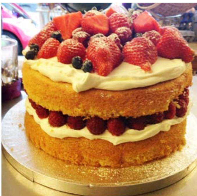
Cake picture taken from Linton kitchen Facebook page

It was a beautiful day. The weather was perfect and all our