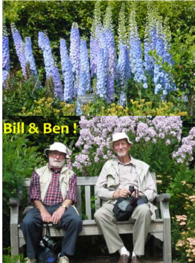
Bill & Ben!