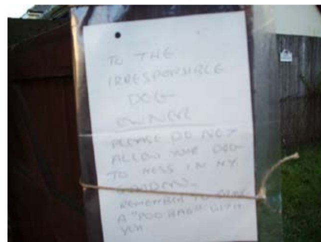
Notice regarding dog fouling placed on a Joiners Road gate

THERE is currently a vacancy for a parish councillor. If you are interested in being co-opted onto the council please come along to a meeting.