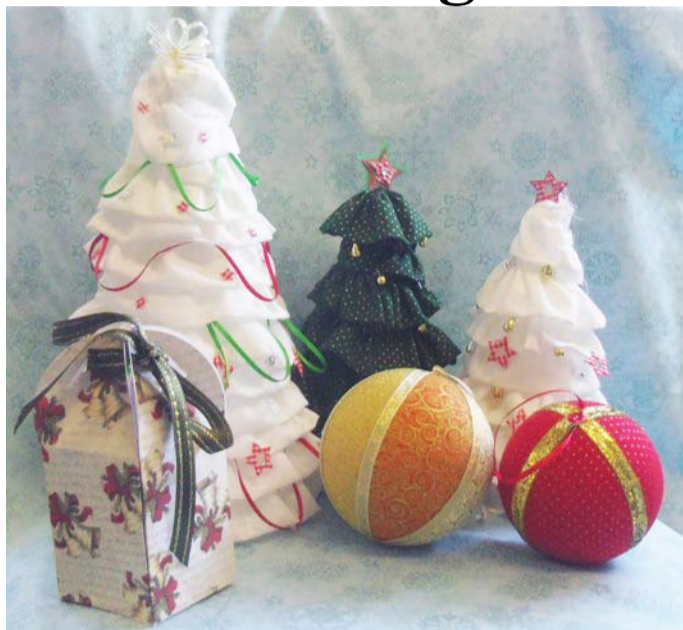
Christmassy things to be made