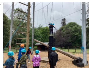
LHJS Crate Staking

Year 4 also embarked on their own residential adventure, spending two nights at Woodrow High House in Buckinghamshire. The visit provided an excellent introduction to residential life, with pupils taking part in activities such as archery, crate-stacking and problem-solving challenges.