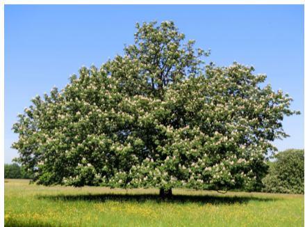
Horse Chestnut at Moyne's Park

From the mid-17 th century onwards, non-native tree species began to appear such as cedars and horse chestnuts, initially within the estates of trend-setting wealthy landowners. By the mid-19 th century, gardeners were able to source an