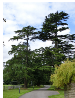
Cedar trees at Hargrave