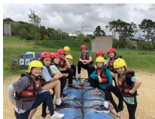
LHJS Raft Building

For Year 6, this marked a significant change from previous years, as pupils to the PGL adventure centre in Lincolnshire for a four-night stay. The new venue offered a fantastic range of exciting outdoor adventure activities, including climbing, abseiling, raft building and team challenges.