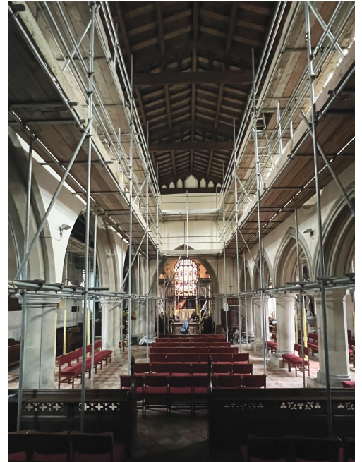
Scaffolding in the church, can you help bear the cost?