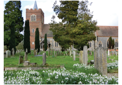
Snowdrops at Stanstead Mounthfitchet