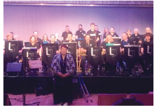
Linton Jazz in concert