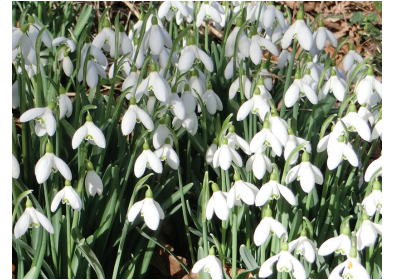
Snowdrops in the sun