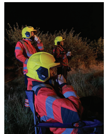
The team take a break

Beacon Youth Trust Summer Activities See page 5