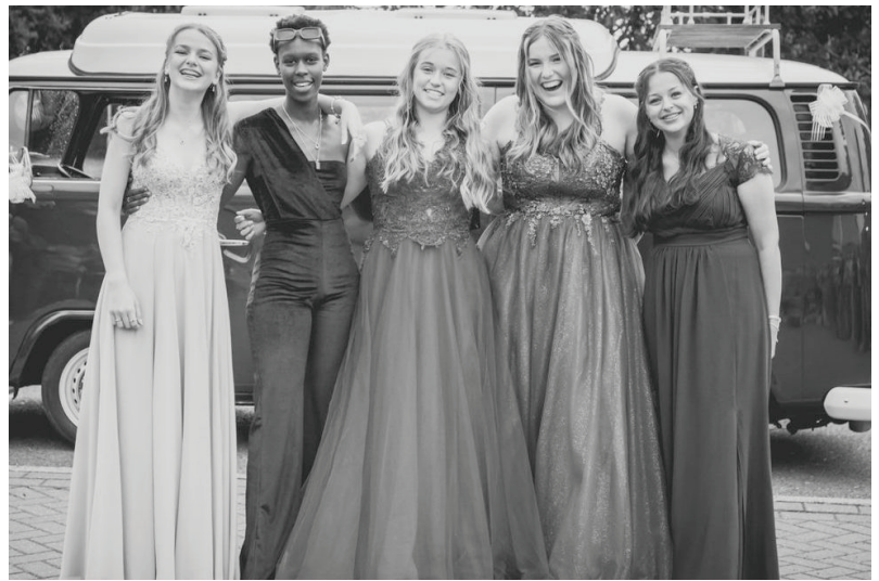
Here come the girls: Students arrive at LVC for their end of year prom. See Marsh Mail page 3