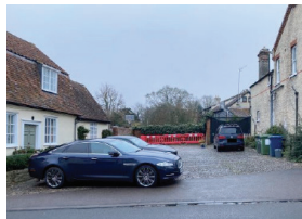
The Market Square - Linton

This has been a long, complicated, time-consuming and expensive process, using funds raised from the Parish Council Precept (that line on your Council Tax bill) in order to engage a suitably qualified Solicitor, expert in Property Law and Disputes.