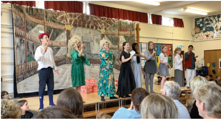
Year 6 treading the boards

THIS week, Linton Heights' year 6 have put on a production called Shakespeare Rocks . It is a modern retelling of the life of William Shakespeare. The story is told by the characters Aubrey and Al, who read from the Bard's perspective.