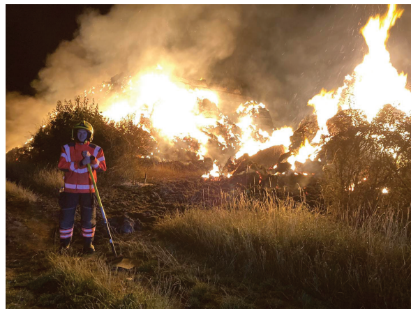
Haystack fires are an all too common occurrence in Summer