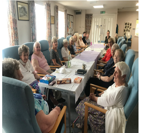
Camsight members meet regularly in Linton