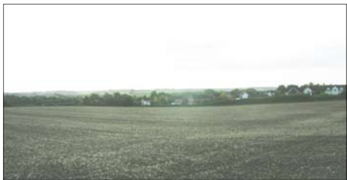
Field on Horseheath Road adjacent to Lonsdale: preferred site for village allotments

Is this the correct site? Response "Yes" - by an overwhelming majority. The LAA was set up to choose the site and we should accept their opinion.