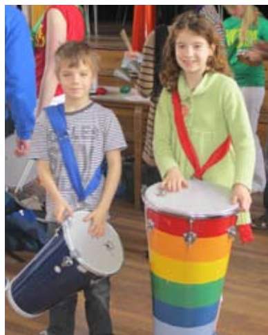
Children enjoying the drums at a Linton Youth Music rehearsal