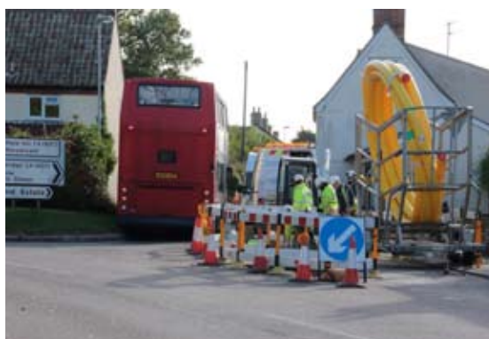
Gas men at work joining the old and the new