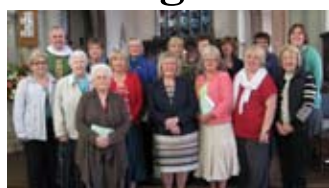
Just some of the bakers from St Mary's