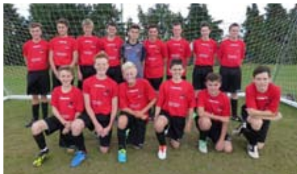
Resplendent in the new away kit