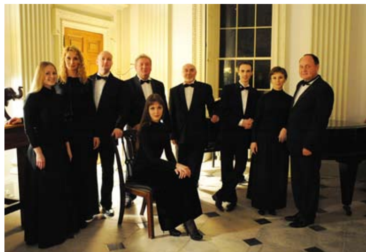
The Russian choir, Voskresenje