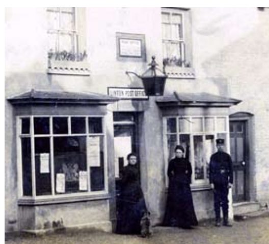
Miss Nottage outside the Post Office in 1903

Items sold in the shop included Hallam's anti-bilious laxative pills. The Cambridge Intelligencer Journal published