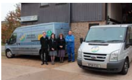
Staff members outside the premises

The unusual name is derived from Hygieia the Greek goddess of health, cleanliness, and sanitation. In addition the firm is the point of contact for many commercial organisations throughout East Anglia who wish to source cleaning items. The latter include dishwasher chemicals, cleaning products, paper disposables such as toilet rolls and hand