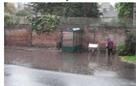
Water, water everywhere