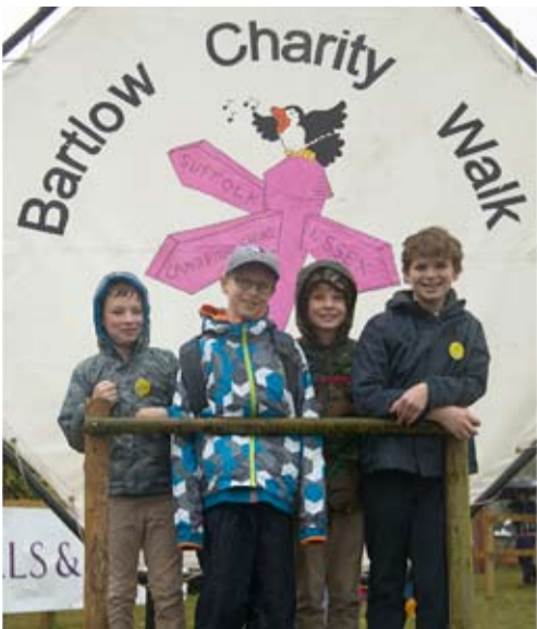
Happy young walkers