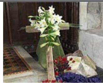
A past display

5.30pm The Duck race on the river Granta with the finishing line at the Horn Lane