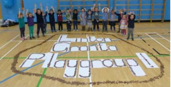
The children spell it out