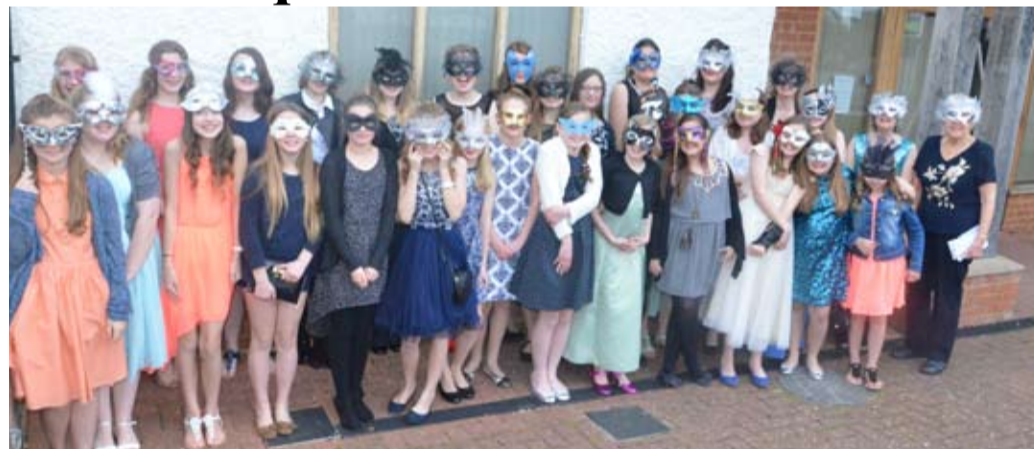
Who can these young ladies be?