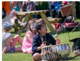
A young man with rhythm

There'll be something for everyone; instrumental, wind band and brass band, choral, classical, pop and rock. All music types will be represented by performers which include adults and young people. The event will close with a set from popular Linton band The Accelerants .