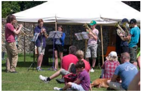
Last year's musical picnic

The LYM musical picnic will take place on Camping Close on Saturday 20 th June from 2.30 to 8pm. It will feature a host of musical talent from in and around the village.