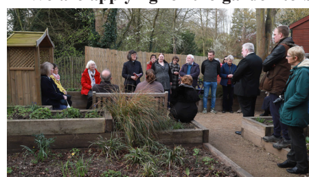
All gathered in the garden

We are applying for the garden to be registered with the