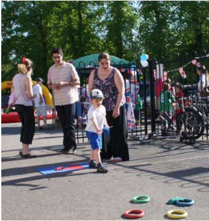
Adults and children alike, enjoying the games