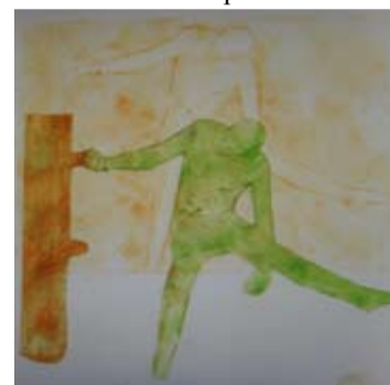
Examples of the sixth form art group's work

The school has support from the Friends of Granta School, FOGS for short. Their purpose is to raise funds for the school to provide extras for the children that school finances cannot stretch to. FOGS were very grateful for the wonderful support it received from the residents of Linton at last year's fete and they are looking forward to even more residents attending the fete on 30 th June between 1pm and 4pm. It is important for the school to have the support from the local community. From the monies raised from last year's fete FOGS has helped to provide funds for a Jubilee Street party where all the children were given commemorative mugs. Also some of the sixth form art group attended the Curwen Print Studios at Chilford Hall, examples of their work is brilliant. I have taken a couple of photographs that hopefully shows their achievements. Copies of these will be on sale at the fete.