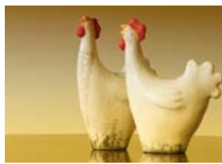
popular Out of the Blocks prints exhibition in May. The eight fine art printmakers were very pleased with the event and we hope to hold a similar exhibition with them next year.

WindmillArt would like to thank the many visitors who came to the very successful and