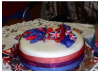
The celebration cake