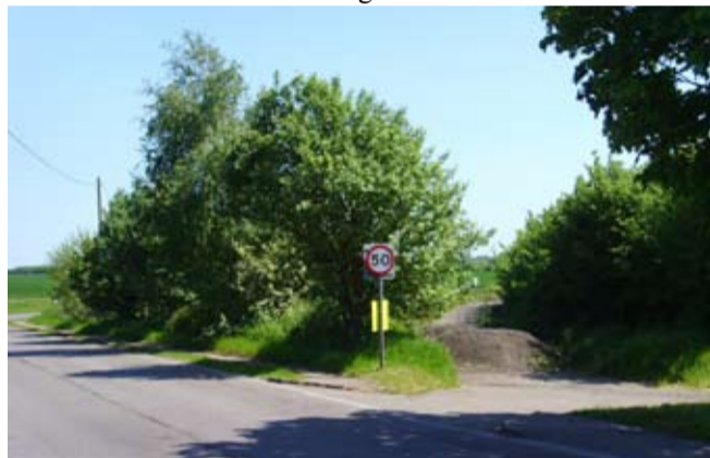
Bartlow Road: likely place for a bus hub