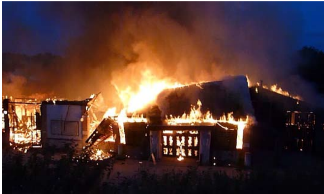
Above the blaze at its height and below, surveying the wreckage of what was a historic landmark the morning after

At the time of going to print, two men from Haveringhill have been charged with arson and intent to endanger life. They could