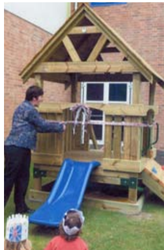
Caroline Derbyshire officially opens the new climbing frame